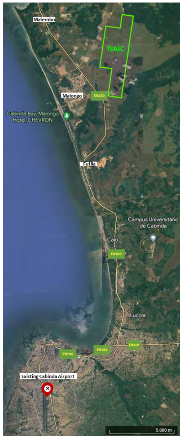
Figure 1: NAIC location in relation to the existing Cabinda airport.

This document is the Environmental and Social Impact Assessment (ESIA) prepared for the construction and development of the New International Airport of Cabinda – NAIC (the Project), located in a greenfield site in the Province of Cabinda, Angola. The ESIA report is presented by ASGC UK 1 , an international construction company, and the management contractor of the Project.